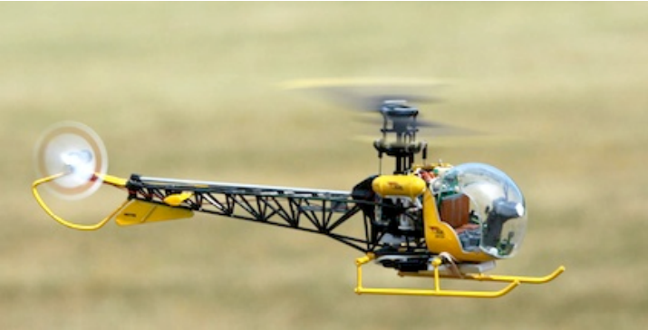
Paul Goelz's very nice tiny, scale helicopter