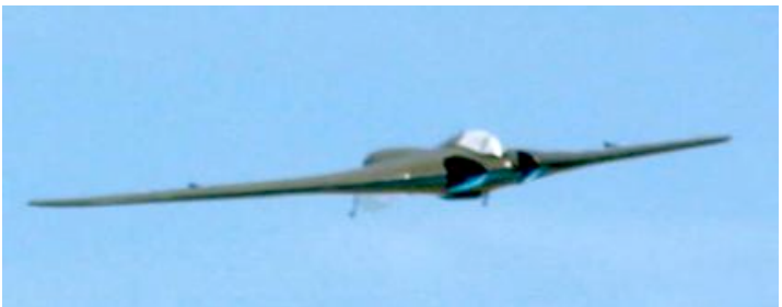
Keith Shaw's Horton EDF Flying Wing