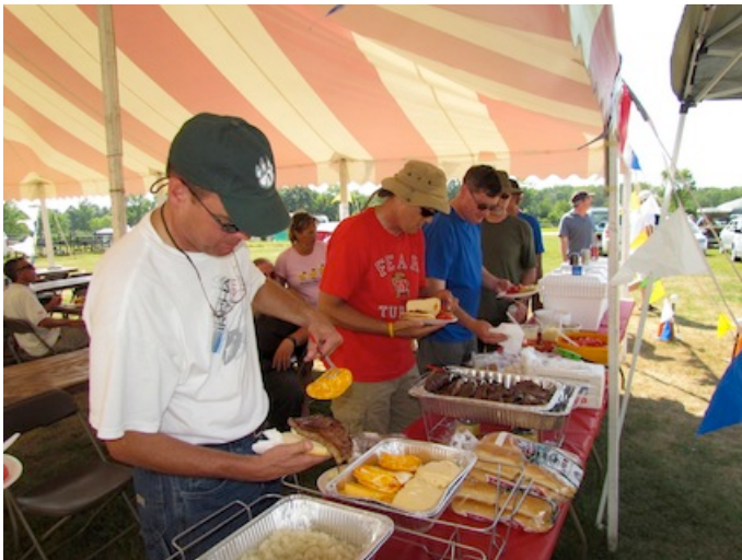
The Potluck Begins