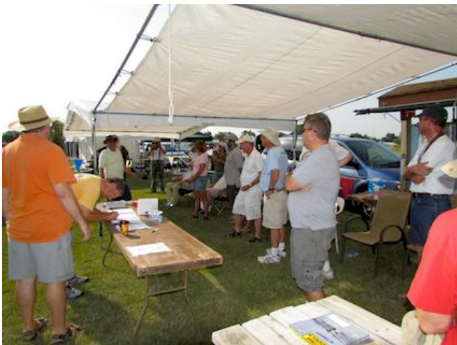
Pilots' Meeting and Registration