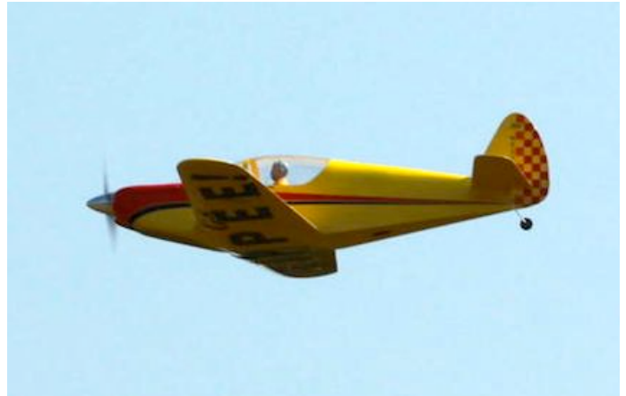
Denny's LoPresti on a flyby

http://www.rcgroups.com/forums/showthread.php?t=1511865