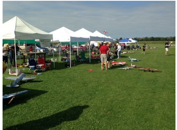
EFO Pit Area at the 2014 CARDS meet