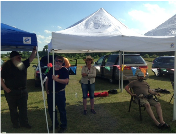
Enjoying Friday Afternoon