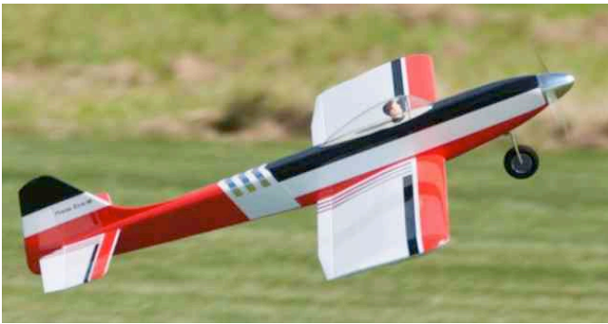
Greg Cardillo Archive photo 2014 Mid-Am Sunday's Awards