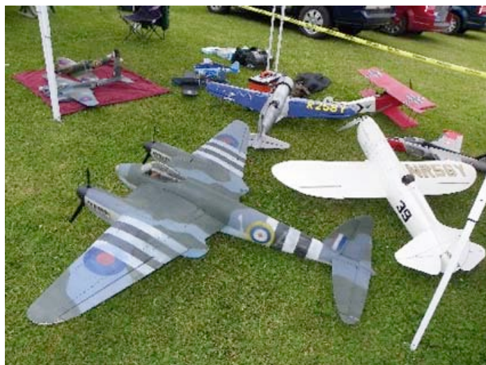
Dave Grife's Air Force (RS)