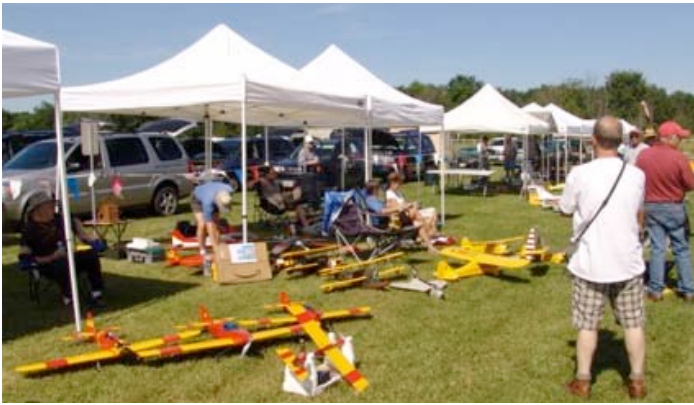
A Look down the flight line Sunday morning (KM)