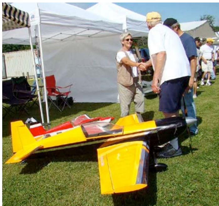
Probably the largest aerobatic planes at the meet (JM)