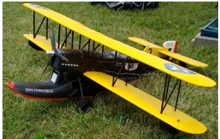
Loening by Classic Aero (JM)