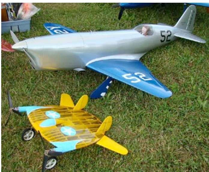
Keith Shaw's Crosby racing plane and Vought V-173 / XF5U-1 "Flying Flapjack" or "Flying Pancake" (JM)