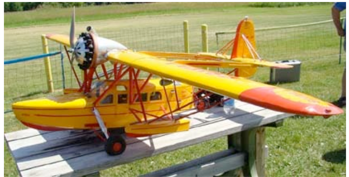
Sikorsky S-39 Single Engine Flying Boat (JM)

Al Muroc, ClassicAero.com came with several of his "fly off the water designs."