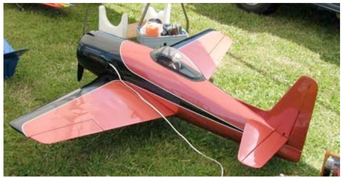
Keith Shaw's Big Ole Bearcat with its new color scheme (MW)