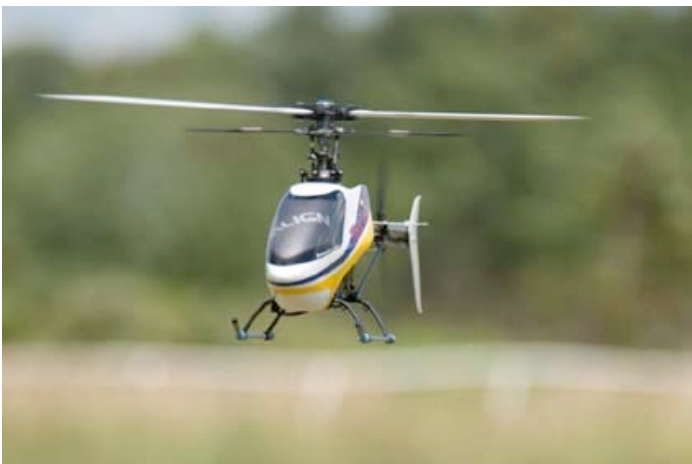
One of many Choppers that flew over the weekend