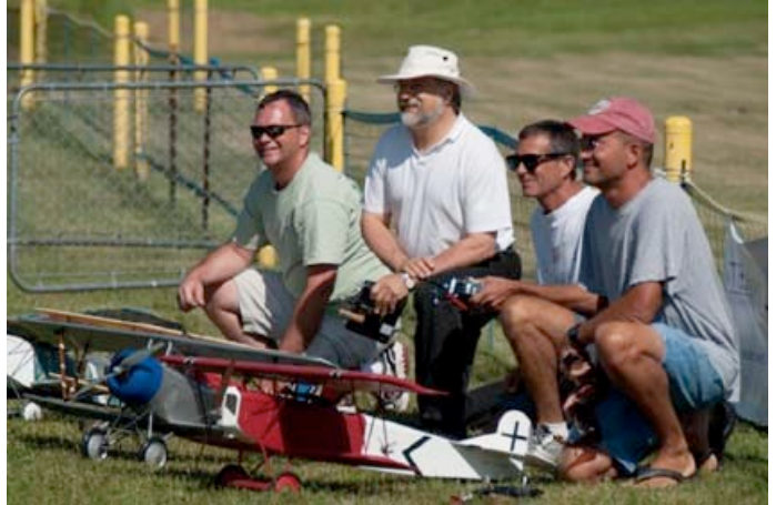
The Dawn patrol awaits word to take to the air at the 2009 Mid-Am

The EFO WEB site has had to move. Now at: http://homepage.mac.com/kmyersefo