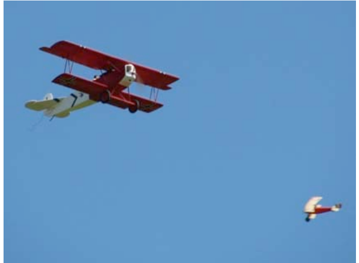
Blue sky as the adversaries' circle (MW)