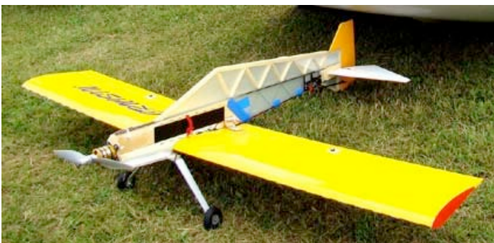
Ray Foley's Crusin' Highly Modified 4-Star 60 (JM)