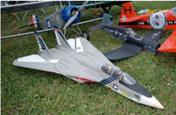
Mark Wolf's Swing Wing (Matt)