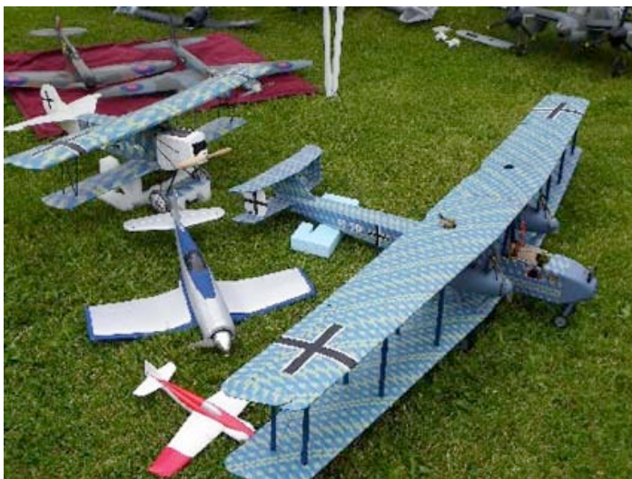
Jim Beagle's Air Force (KM)