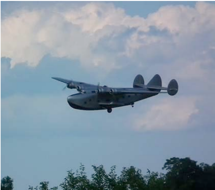
Big, beautiful Boeing 314