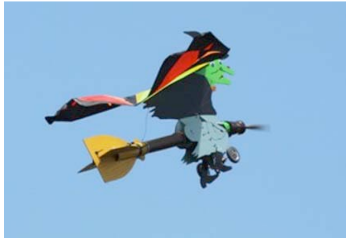
Walt Thyng's Flying Witch