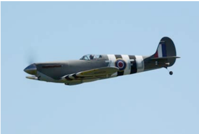
Denny Sumner's CMP Spitfire