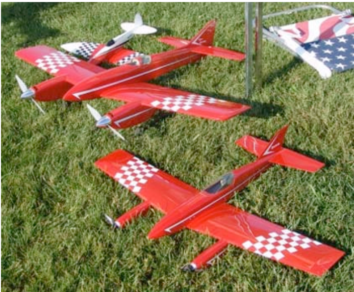
Denny Sumner's Sportwin and Super Sportwin