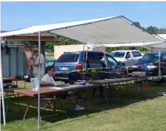
Registration and Impound (KM)