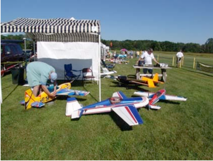
Putting the 'Big 'ens' together takes awhile!