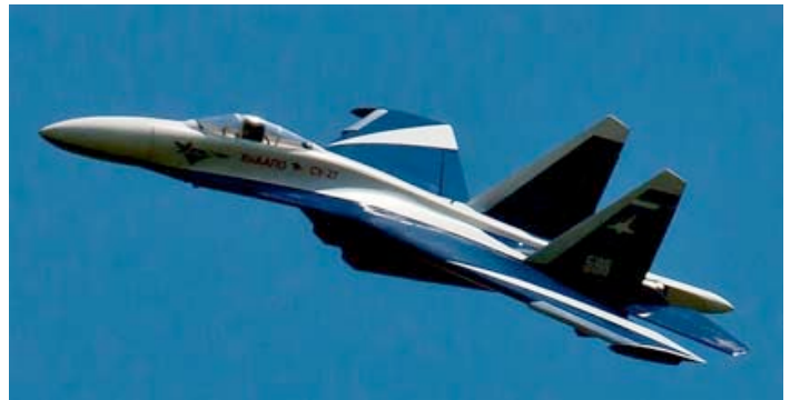
Tom Bacsanyi's Big Sukhoi 27 EDF