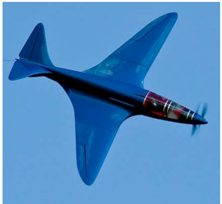
Keith Shaw's Bugatti with cloud reflections in the wings