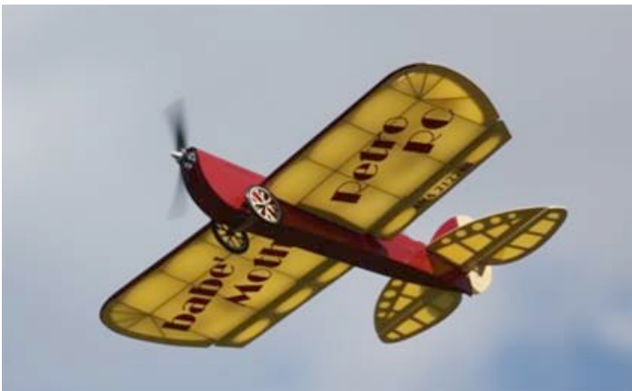
Mark Freeland's new babe' moth

The model is complete with a dummy 2-stroke engine with a detailed carb with carburetor arm and real glow plug in the top. Best thing about this one is that there is no "goo" to clean off after the flight!