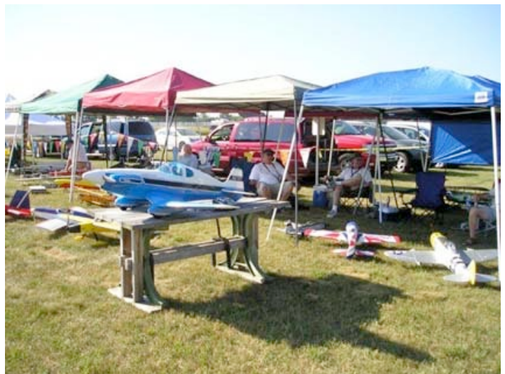
Some of the RCCD folks enjoying the day.