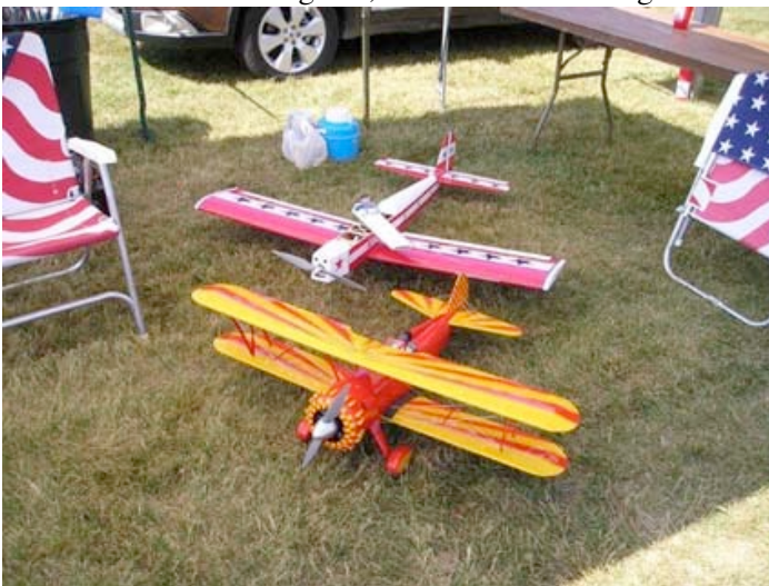
Ken Myers' Super Stearman & Flite 40