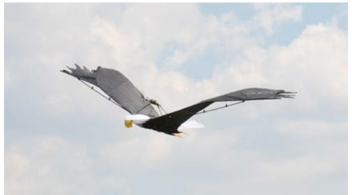
Wade Wiley's Eagle scaring the heck out of the local birds