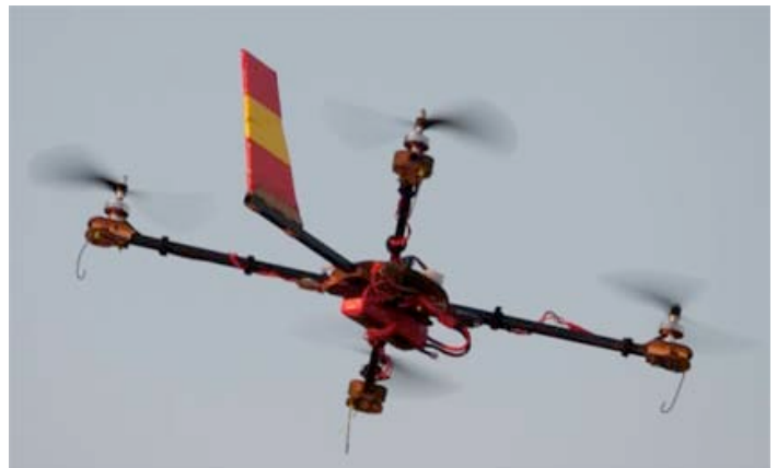
A Quadcopter in flight