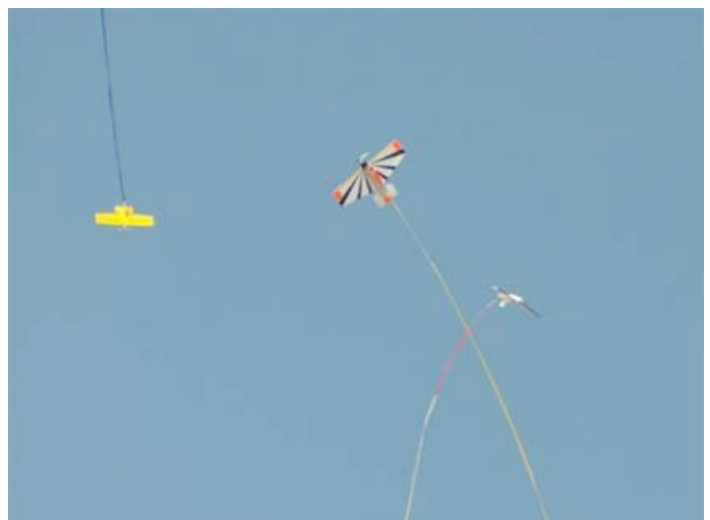
Impromptu Combat on Saturday afternoon