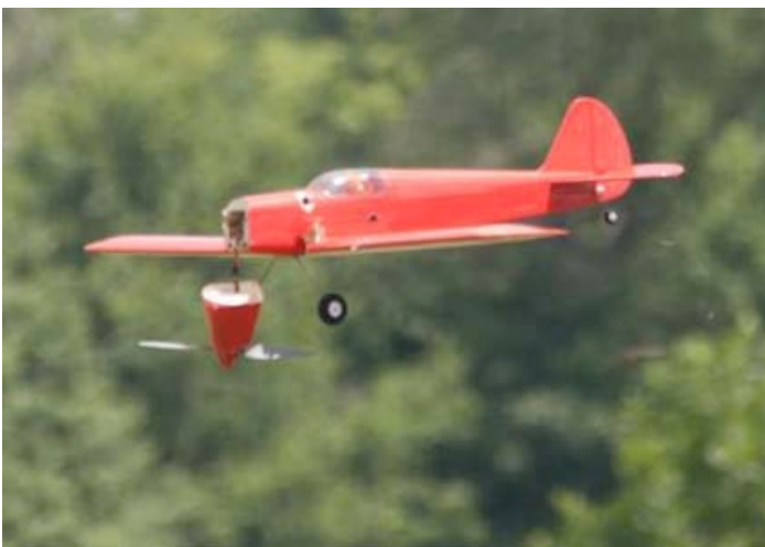
Roger Wilfong's oops with the Super Sportster Flew in just fine