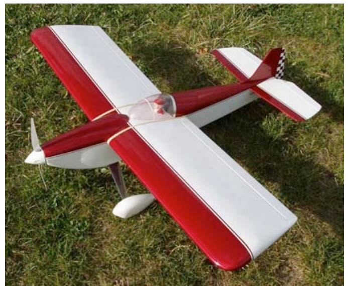
Mark Rittinger Photo

( http://www.rcgroups.com/forums/showthread.php?t=1161755 )