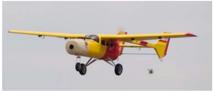
Wade's plane on a pass