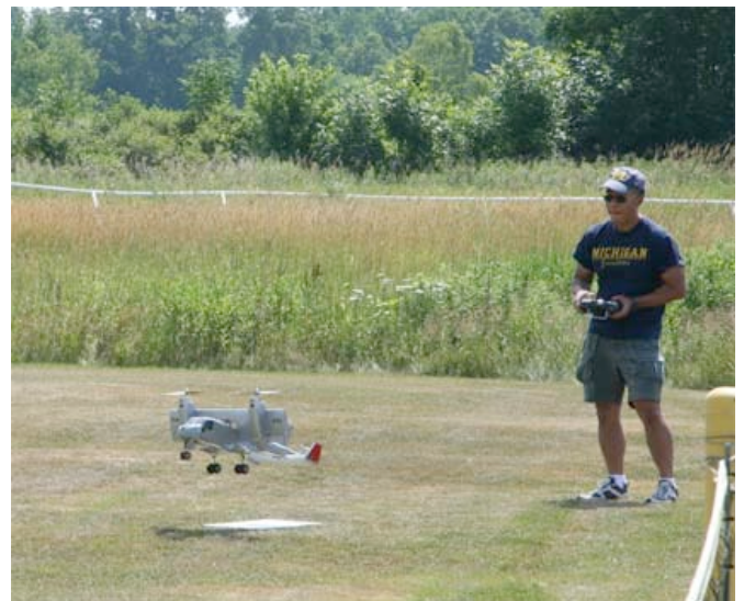
The tilt-wing takes off