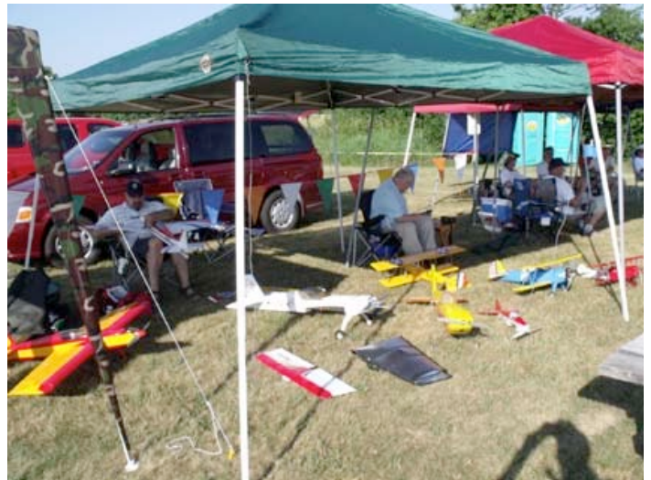
Getting ready and seeking shade