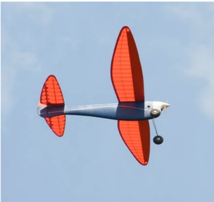
Old Timer Thermaler