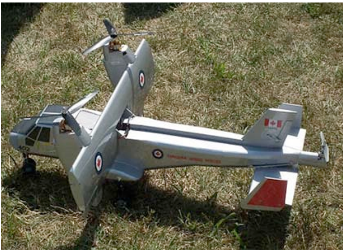
One of the more unusual creations at the meet. This one by Le Phan.

There were a lot of different types of flying machines that took to the air at the Mid-Am this year.