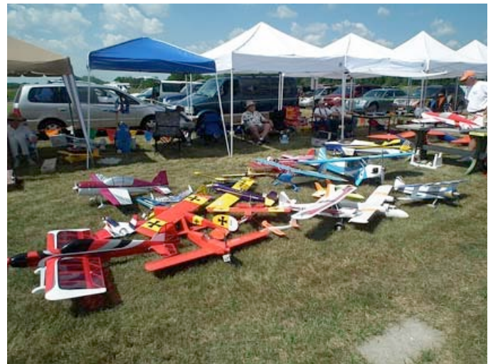
Some of the planes ready to take flight.