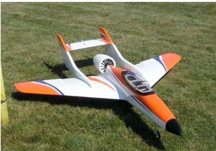
Tom Bacsanyi's Big, Powerful EDF Power to weight ratio was awesome!