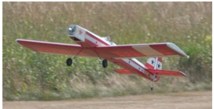
Flite 40 Takes flight