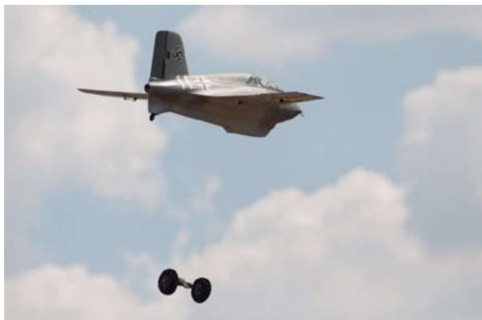
Me-163 gear drop