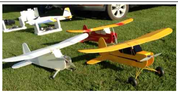
Norm Peters' Old Fogey along with Ken Myers' prototype (white) and Mk II (red and yellow)

The photos of Norm's and Ken's Old Fogeytype trainers were taken at the June meeting.