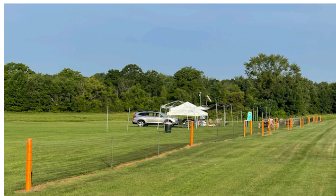
Early morning on the flightline, before the attendees arrived.