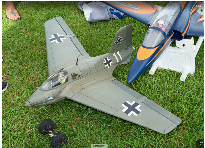
Dave Grife's beautiful looking and flying Me-163.