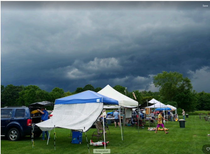
Packing before the storm broke.

About 40 minutes later, the storm subsided and a few folks got back to flying.