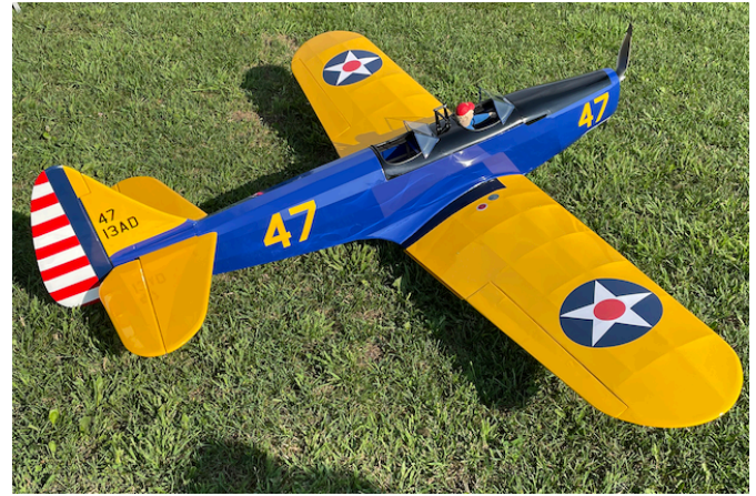
Don's PT-19.