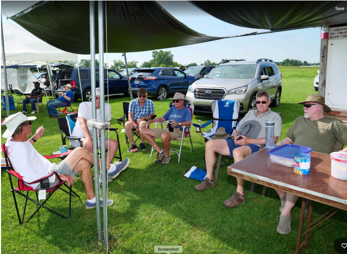
The folks sought shelter from the sun and exchanged laughs, stories and information.