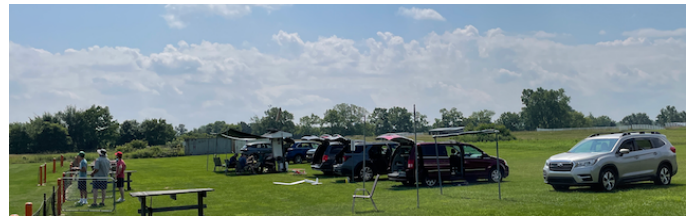
Later in the day on Sunday