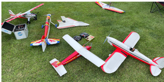
Some of Joe Hass' fleet getting ready.

These are just some of the planes awaiting their turn to take to the air.