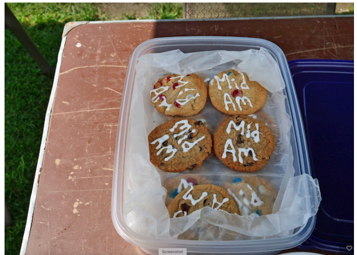
Don's Mid-Am Cookies