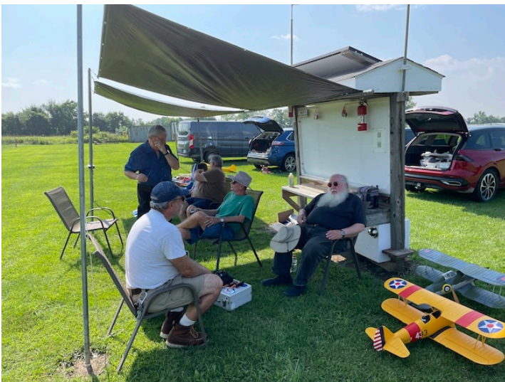
Early Sunday Morning

Sunday turned out to be a beautiful day with much milder winds, but still hot and humid.