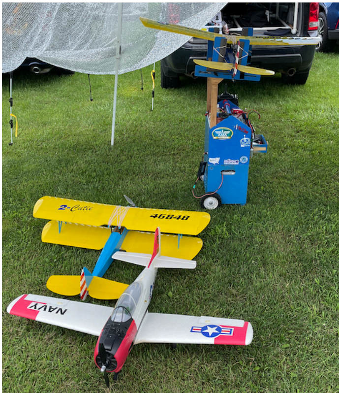
Roger Wilfong's pit area with his unique flight box/charging station.